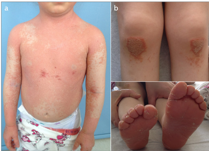
Figure 2. a-c. a) Psoriasiform plaques which tend to merge on the anterior and posterior trunk, b) Psoriasiform plaques on the bilateral knees, c) Plantar keratoderma